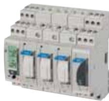
Eos-Array / Eos-Array Lite