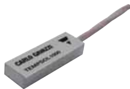
TEMP SOL / IKE20001K