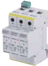
DSB / DSF