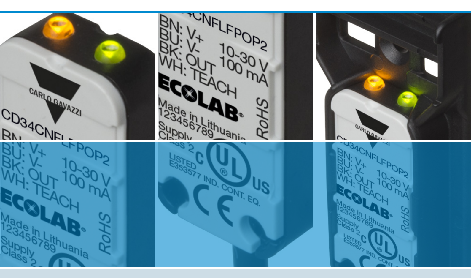
CD34 - Capacitive sensors