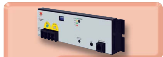
SBC30A 30A battery charger. Voltage:12, 24VDC