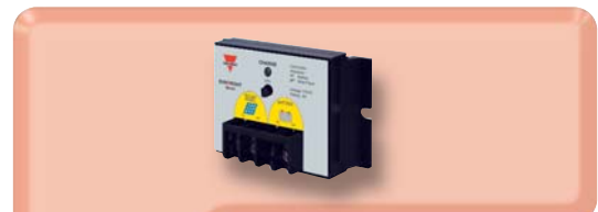
SBC6A 6A battery charger. Voltage:12VDC