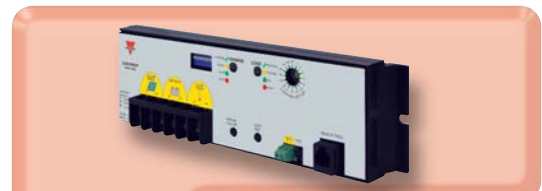
SBCLC30A 30A battery charger with Load/Light Control. Voltage:12, 24, 48VDC