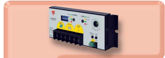
SBCLC20A 20A battery charger with Load/Light Control. Voltage:12, 24, 48VDC