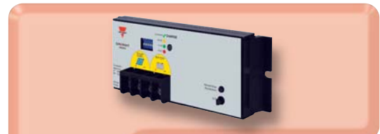
SBC20A 20A battery charger. Voltage:12, 24VDC